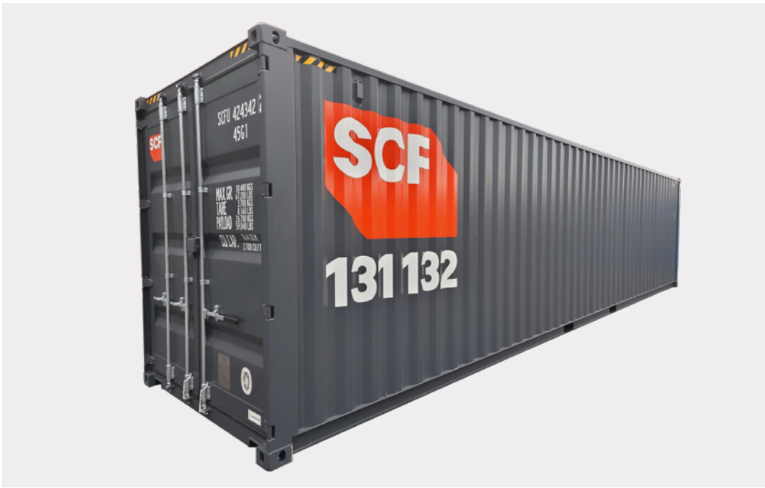
Top Left: 40ft high cube shipping containers provide the most onsite storage in our range (or anyone else's).